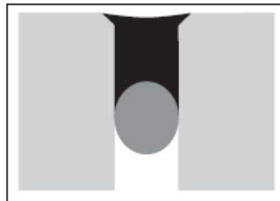
Flush joint design rules out trip hazards and dirt traps

Backing: Use closed cell, polyethylene foam backing rods.